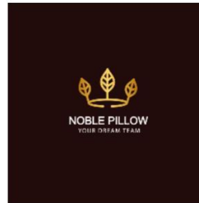
Logo design by artstein for Noble Pillow