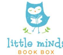
Logo design by green in blue